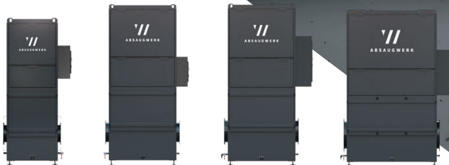
↑ Oil mist separator O/E series 1000–4000